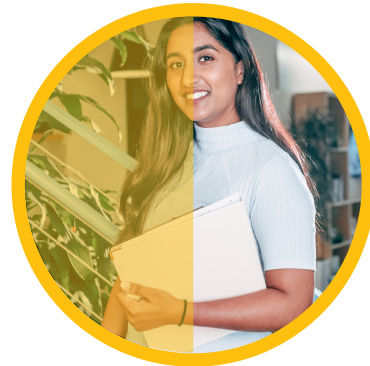
Accounts Receivables Specialist