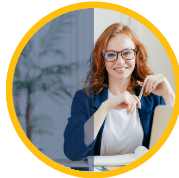
Accounts Payables Specialist

We have the Proficient talent pool with great expertise in Accounting & Bookkeeping, Taxation, Payroll Processing, Financial Analysis & other processes specific task. Here are the common roles we offer to our client for their accounting requirements.